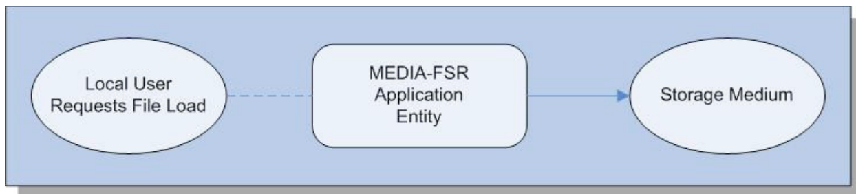
Figure 5.1-1. IMPLEMENTATION MODEL

The application is a .NET application that provides a user interface, network support and media support as a File Set Reader.